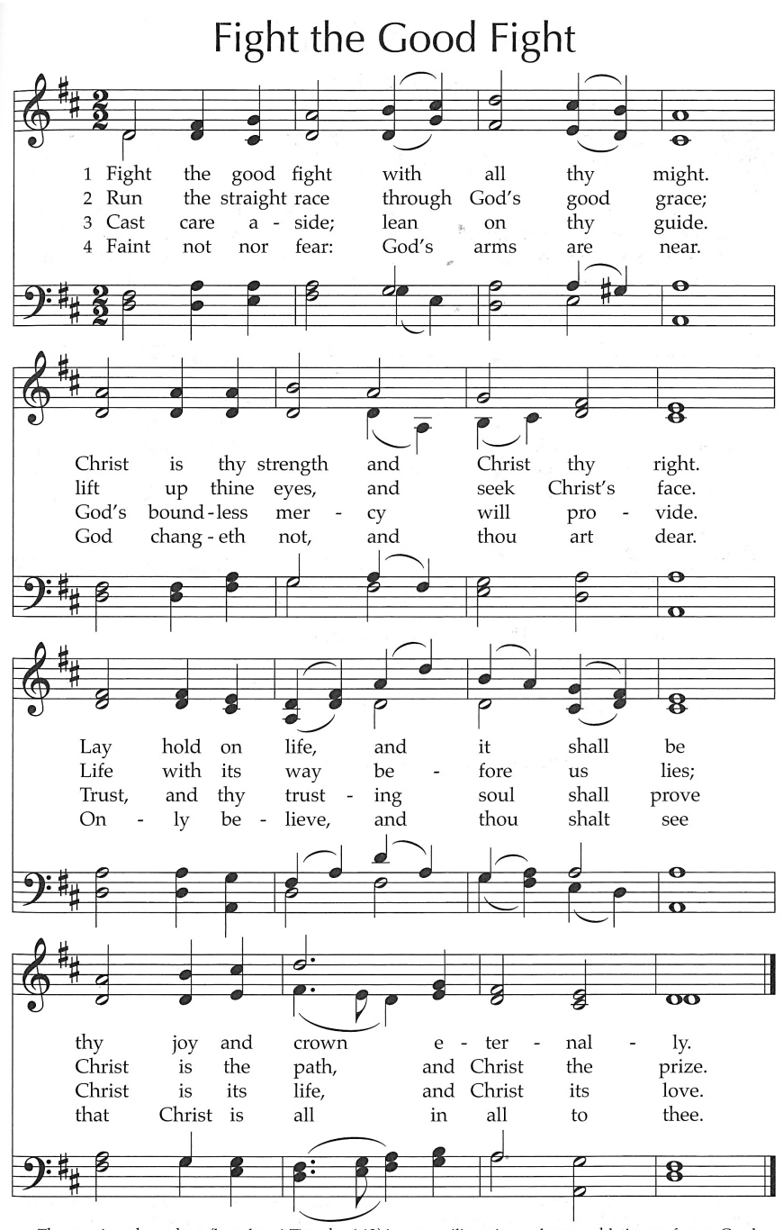
The opening phrase here (based on 1 Timothy 6:12) is not a military image but an athletic one, from a Greek verb meaning "struggle" or "grapple" or "wrestle." The sports context continues in later stanzas reflecting the experience of a runner (recalling Hebrews 12:1–2).